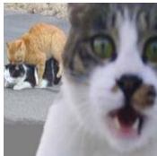
Wars of the Master